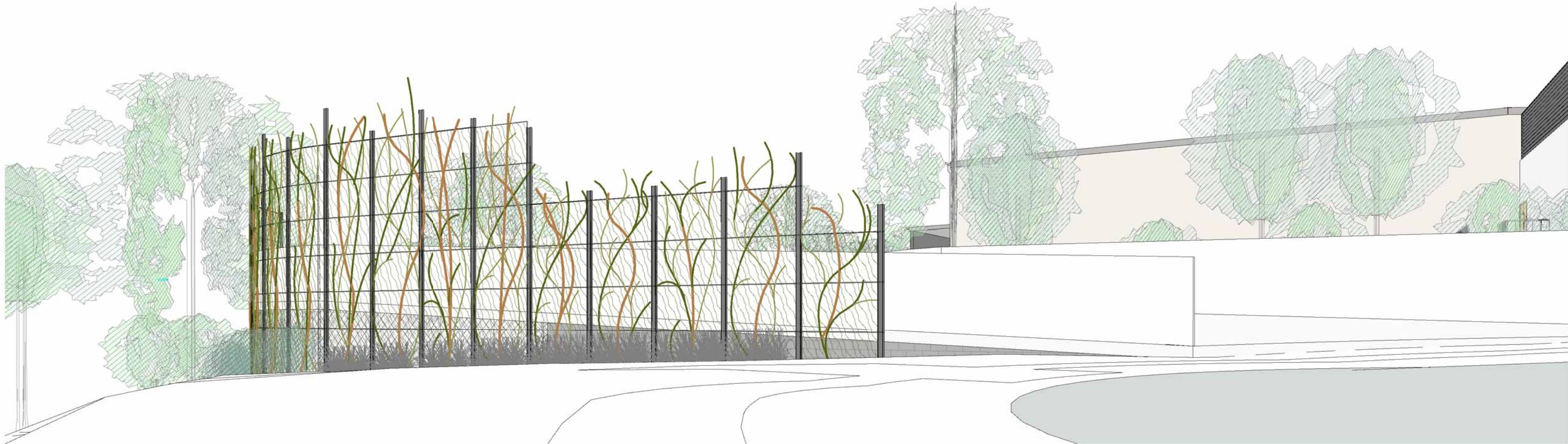
2 VIEW FROM SIDE - LOADING DOCK RAMP