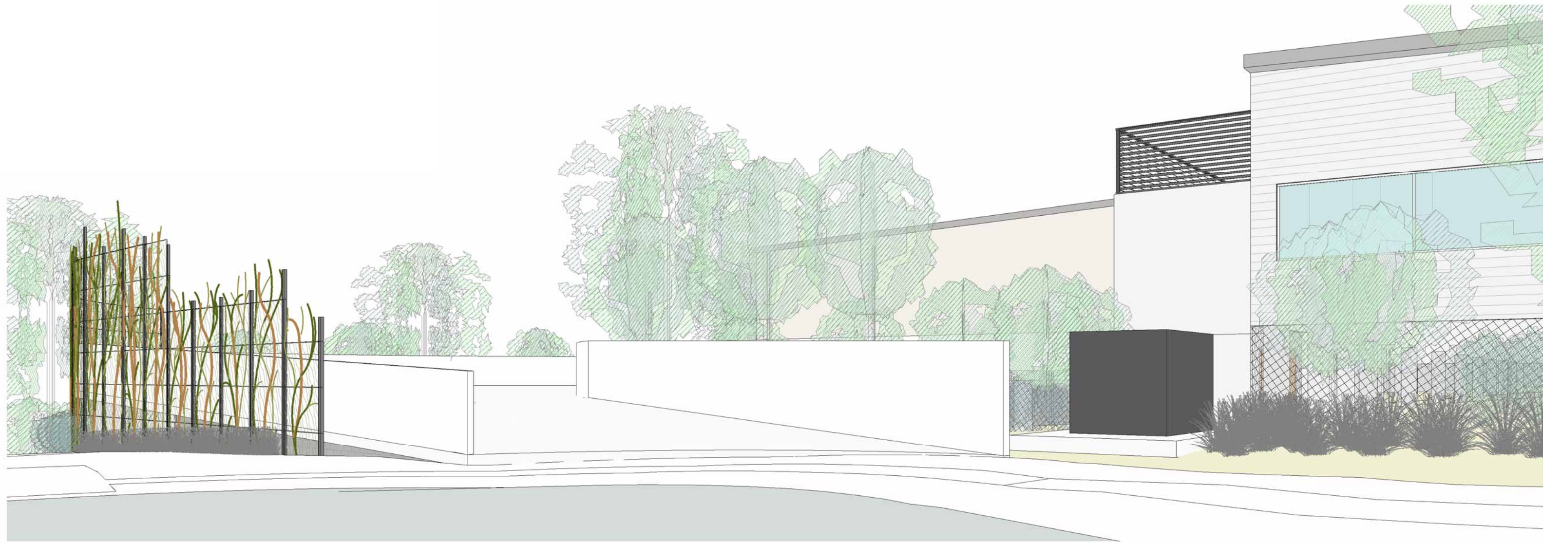
1 VIEW FROM BEECH CLOSE - LOADING DOCK RAMP